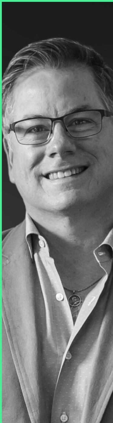
JOHN DICKSON: 5 REASONS YOU CAN STILL DEPEND ON THE BIBLE