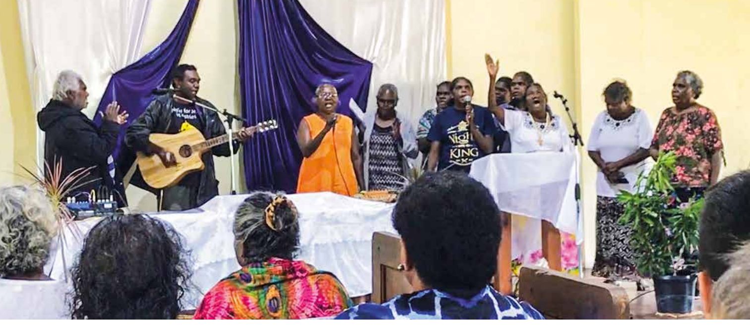
The Yolngu people of Arnhem Land celebrate the dedication of the Gospel of Mark in Dhuwaya language